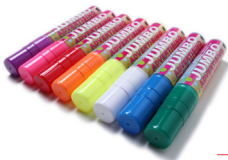
SCRITTO ® CHALKMARKERS SCRITTO ® KREIDESTIFTE